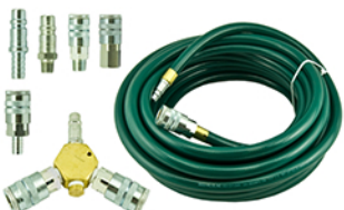
Hoses & Fittings