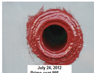
July 24, 2012 Prime coat 998