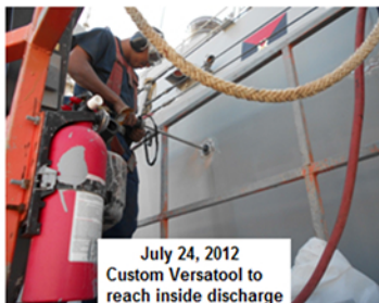
July 24, 2012 Custom Versatool to reach inside discharge