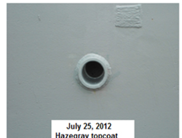
July 25, 2012 Hazegray topcoat