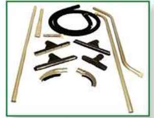
Industrial Tool Kit and accessories available