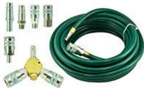
Hoses & Fittings

55 Gallon 2V: 340.87255.01 (HEPA) 340.70255.01 (Wet/Dry) 55 Gallon 1V: 340.87555.01 (ULPA) 340.70555.01 (Wet/Dry) 30 Gallon 1V: 340.87530.01 (ULPA) 340.73103.01 (Wet/Dry)