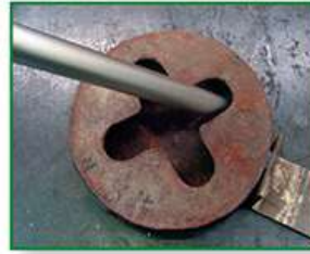
Cloverleaf (pictured) and Padeye liquid removal