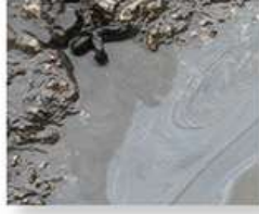
Oil & Sludge