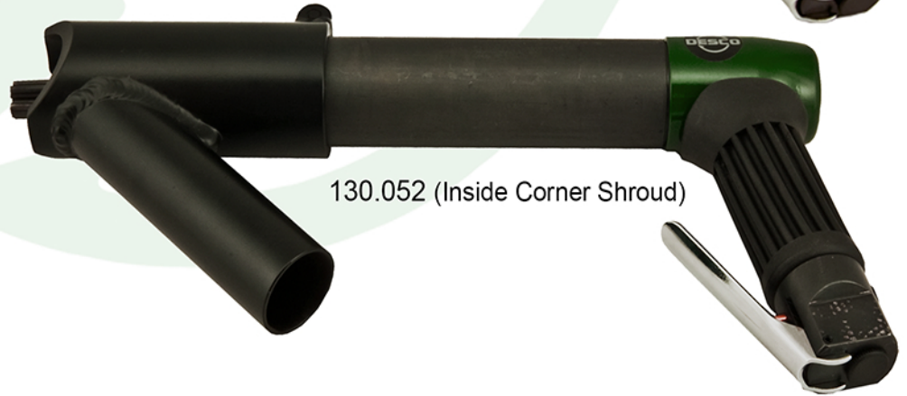
130.052 (Inside Corner Shroud)