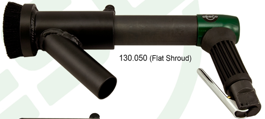
130.050 (Flat Shroud)